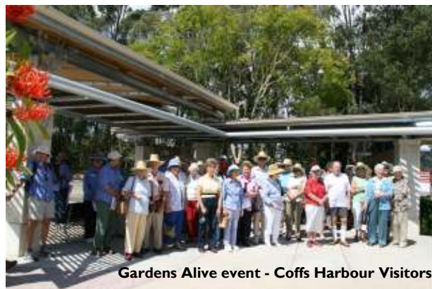
Gardens Alive event - Coffs Harbour Visitors